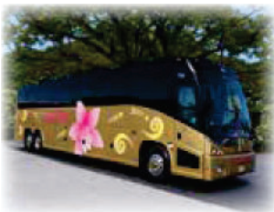
Waikiki Transportation $18.00 per person