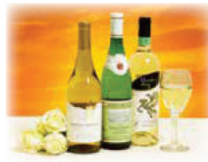
Robert Mondavi Private Selection Chardonnay $45.00 per bottle