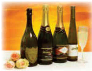
Mumm Sparkling Wine $80.00 per bottle